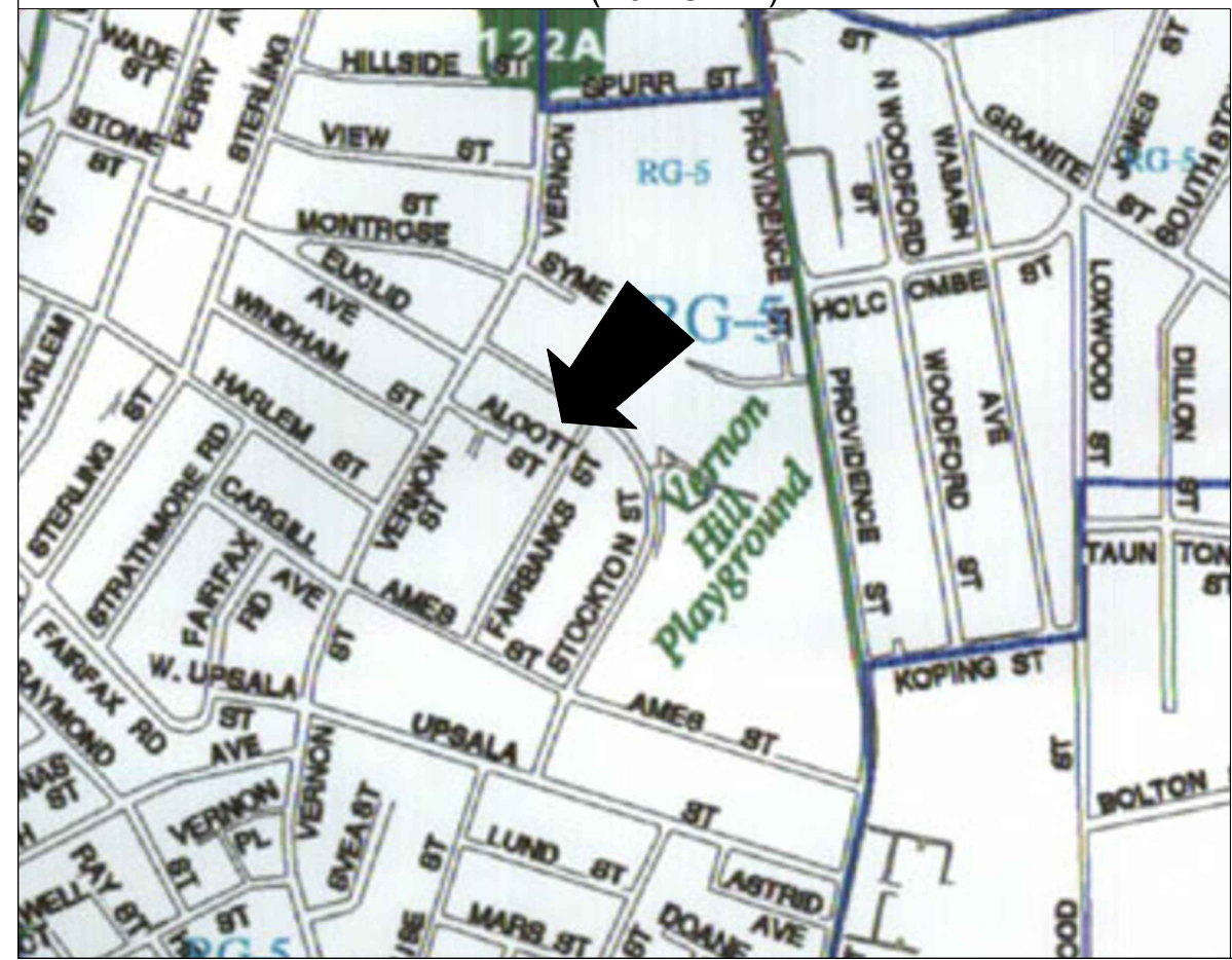
LOCUS MAP (NO SCALE)